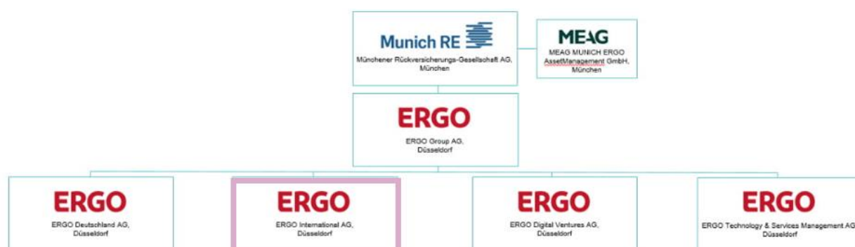
Figure 1. Structure of Munich Re and ERGO Group AG

The Company is 100% owned by ERGO International AG, Germany, which is part of the ERGO Group AG, Germany, which in turn is part of the Munich Re Group (Münchener Rückversicherungs-Gesellschaft AG, Munich). ERGO Group is one of the major insurance groups in Germany and Europe, offering a comprehensive spectrum of insurance services.