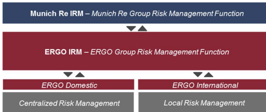
Figure 4. Risk Management Organization Munich Re and ERGO Group

In ERGO the risk management function is carried out by Risk Management division. The Head of Risk Management reports directly to the CFO. Reporting lines have been set up between the head of risk management function and ERGO Group CRO.